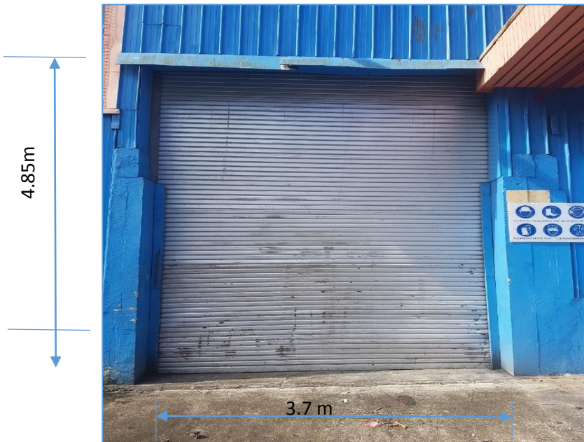
Figure 1 shows the view of the rear end shutters of the Deuba Power Station with the measurements in meters.