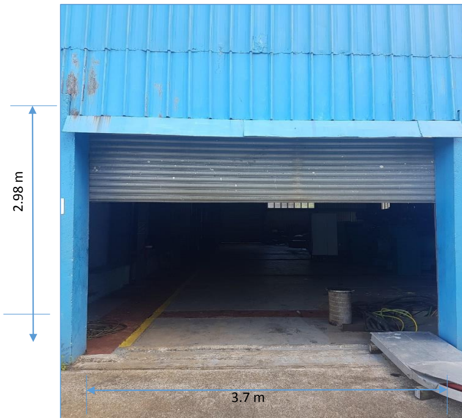
Figure 2 shows the view of the front end shutters of the Deuba Power Station with the measurements in meters.