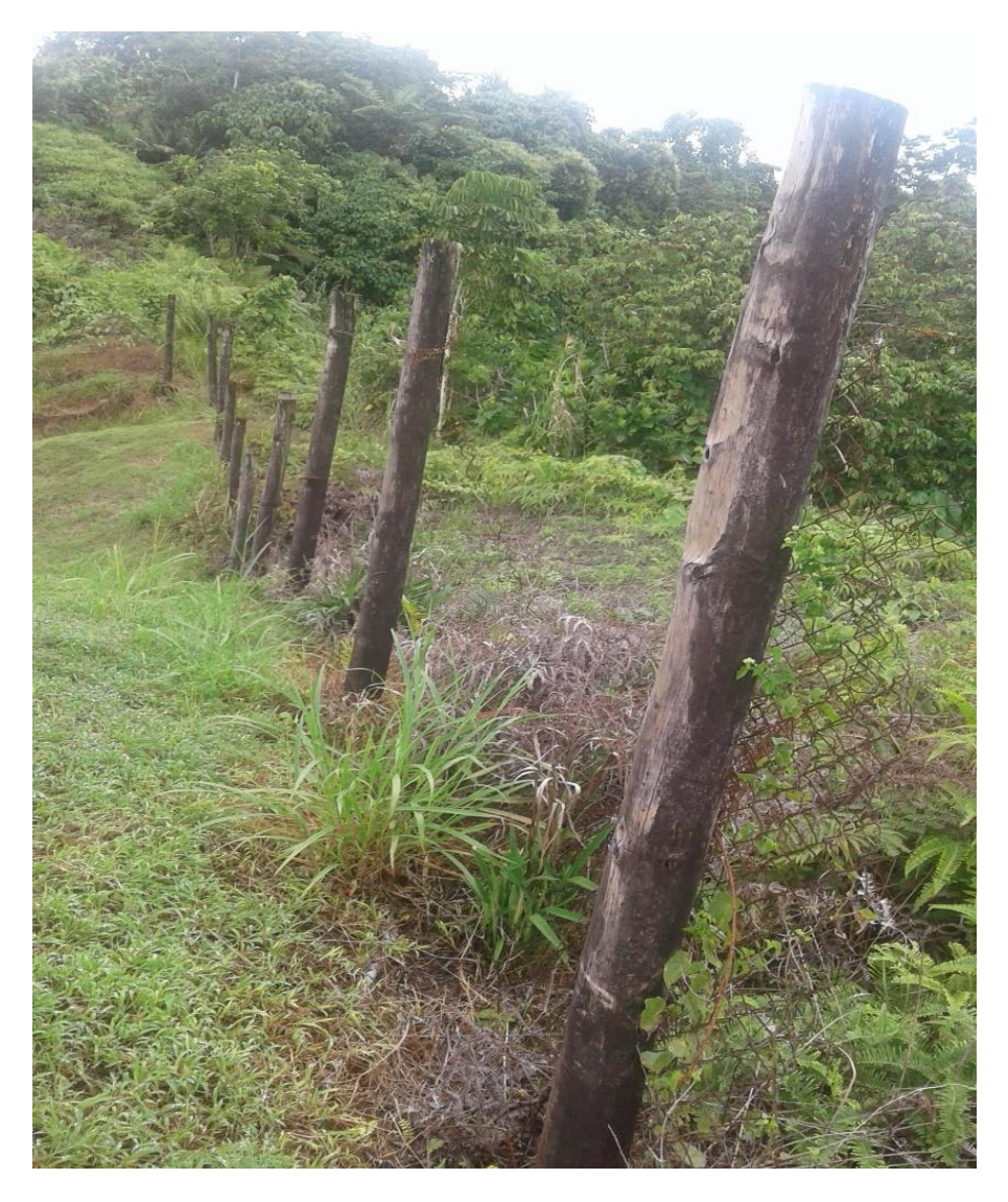
Fig 3. Section of fence where chain link is missing