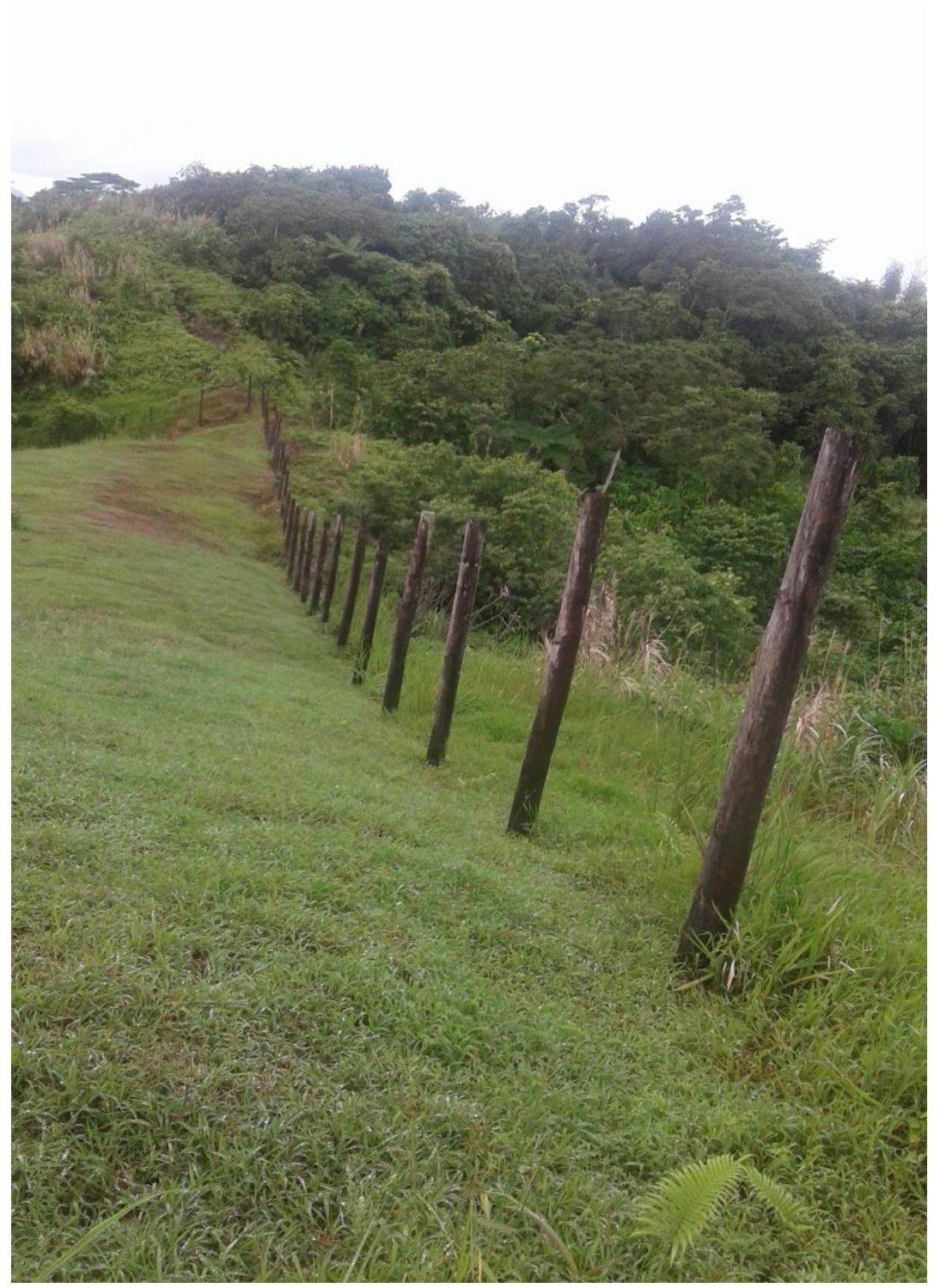
Fig1. Section of fence where chain link is missing