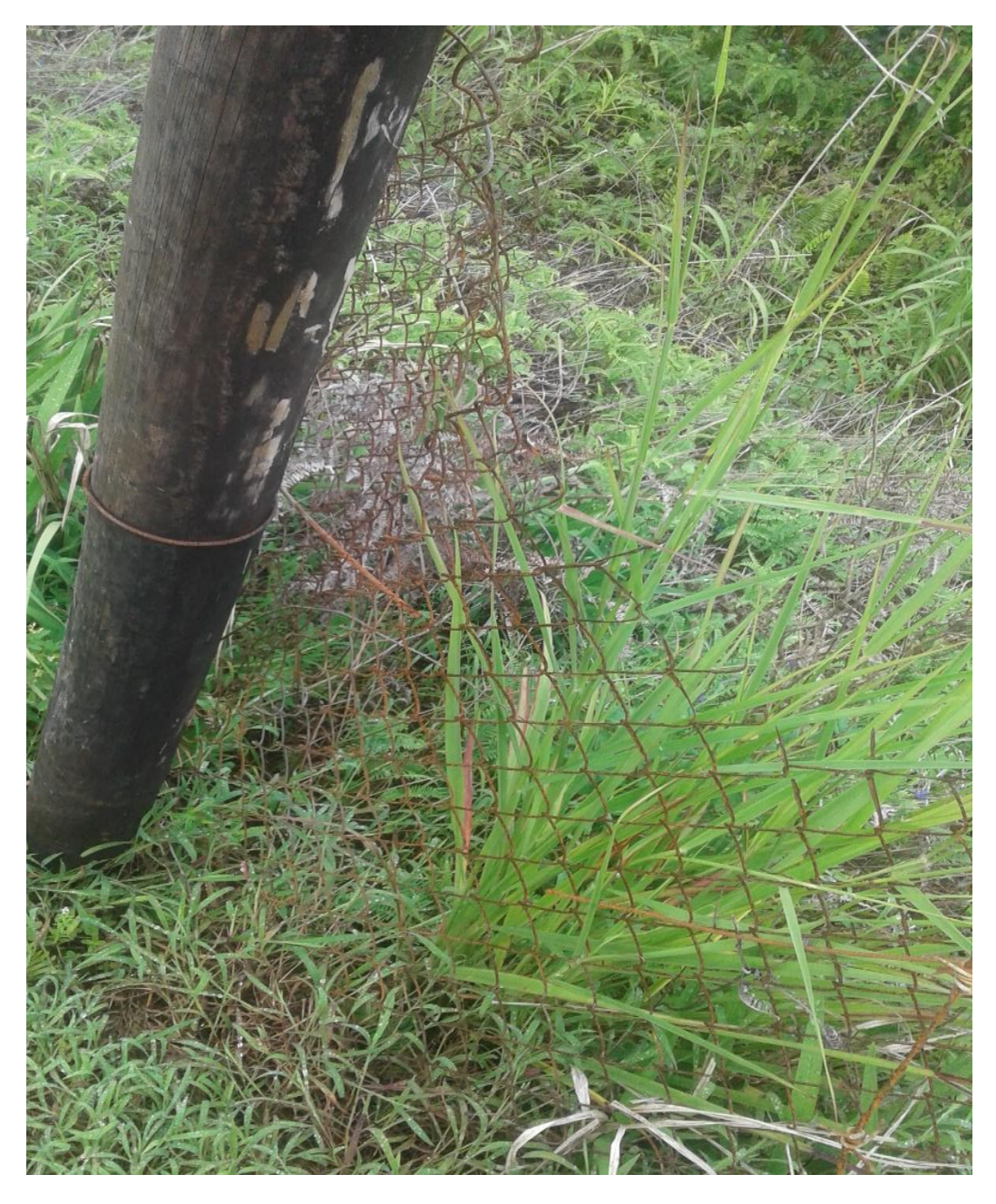
Fig 2. Section of fence where chain link is damaged