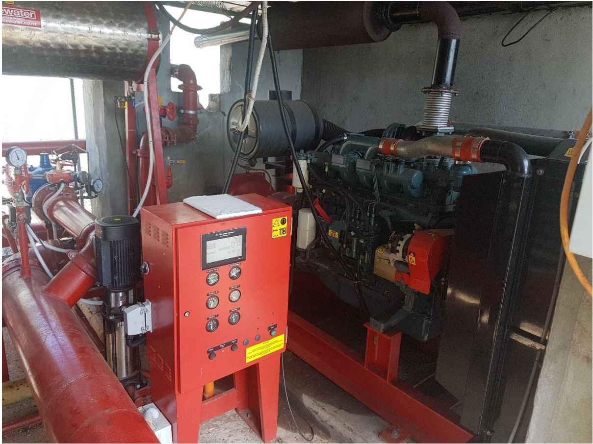
Figure 2 New Kinoya Fire Pump Unit