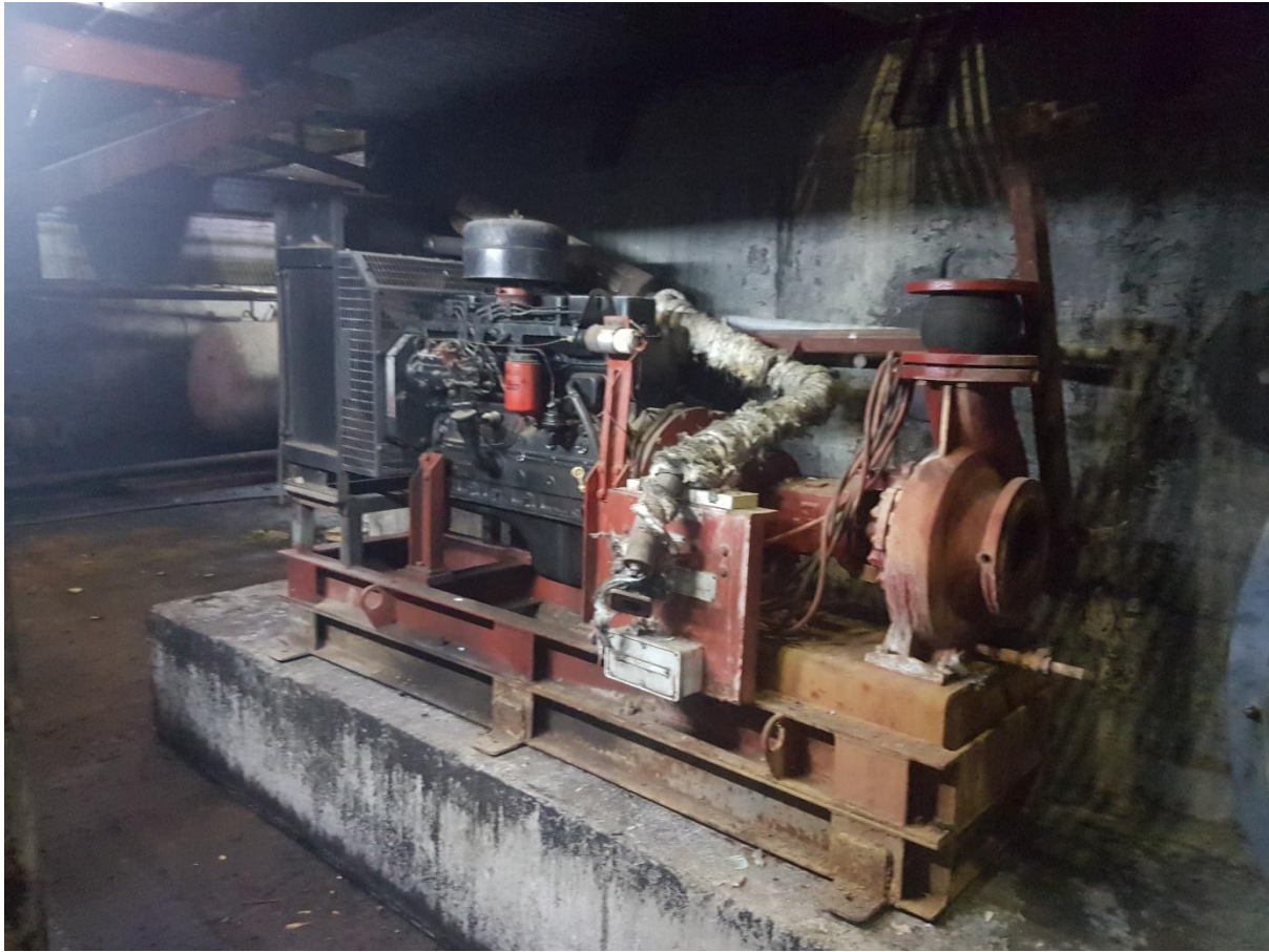
Figure 1 Old Kinoya Fire Pump