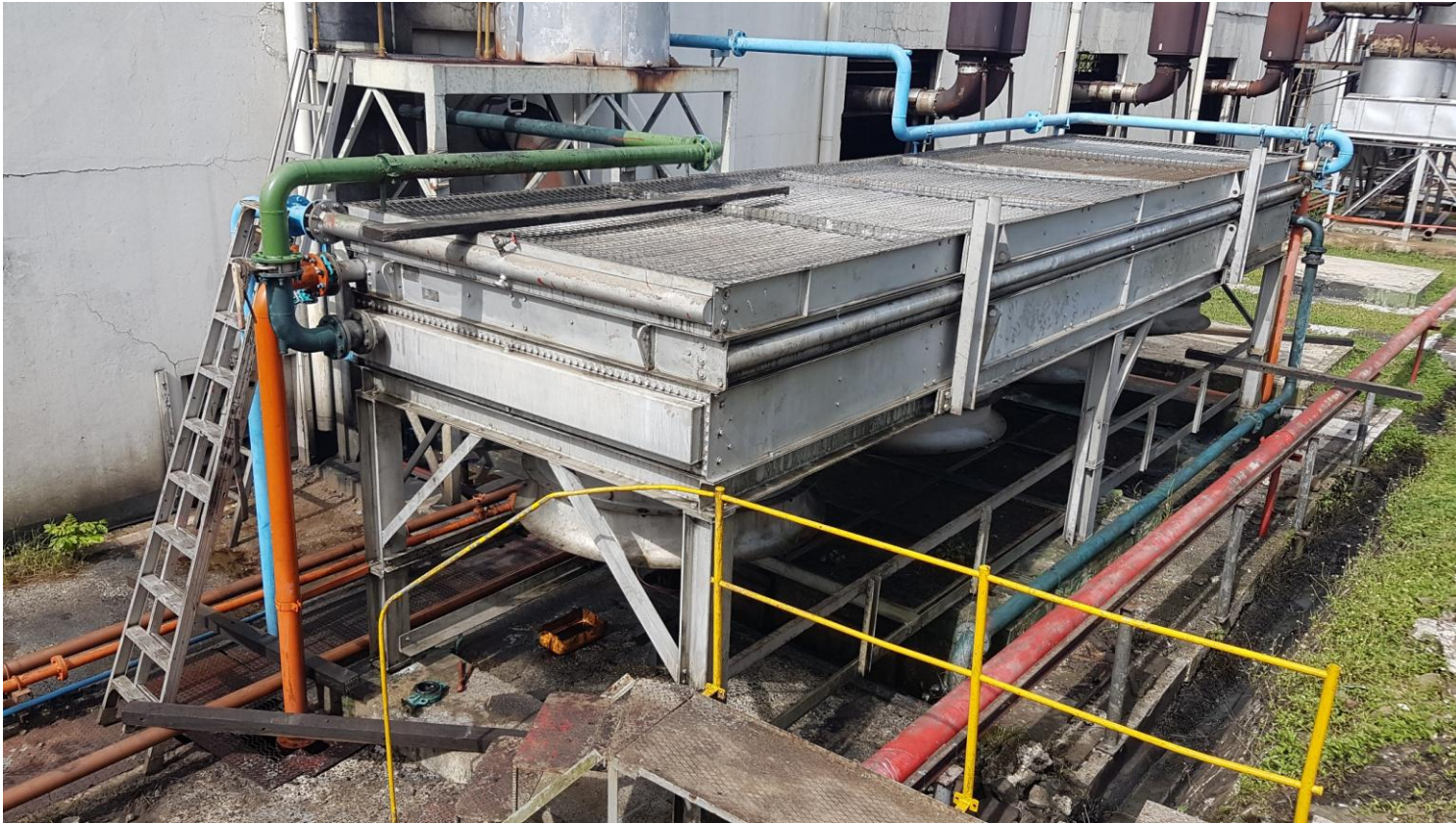
Figure 2 Photo of Current Radiator