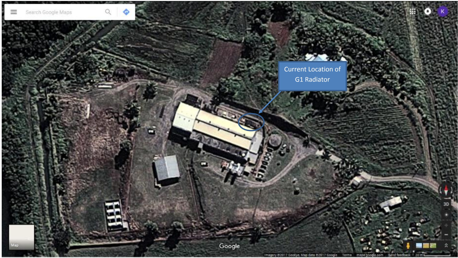
Figure 1 Layout of Labasa Power Station