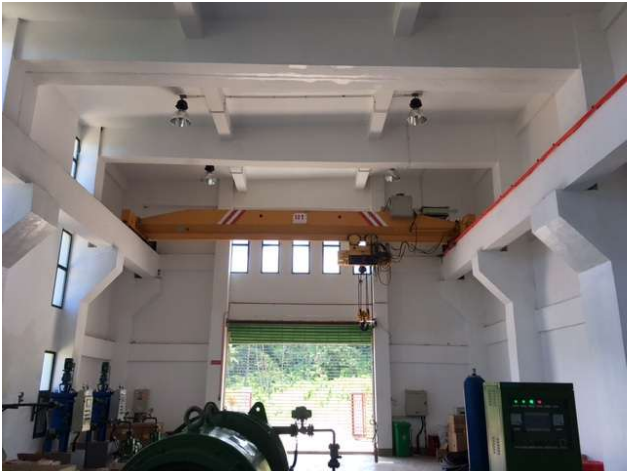
Figure 1 10 ton Crane