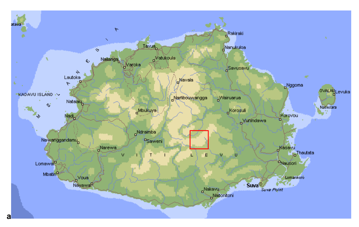
Figure 1 – Viti Levu Island, Fiji. Approximate site location shown in red box

The Site of the proposed Works is the Wailoa powerstation on Viti Levu in the Republic of the Fiji Islands. The site is normally accessed by road from the Capital, Suva.